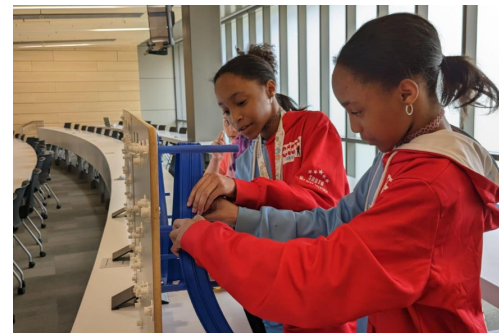
From left to right: Calvin University FYRES Students; Michigan Technological University's Astro Huskies HONES student team; Participants in Earth System Science STEM Camps